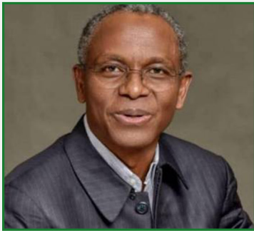
Malam Nasir El-Rufai Executive Governor of Kaduna State