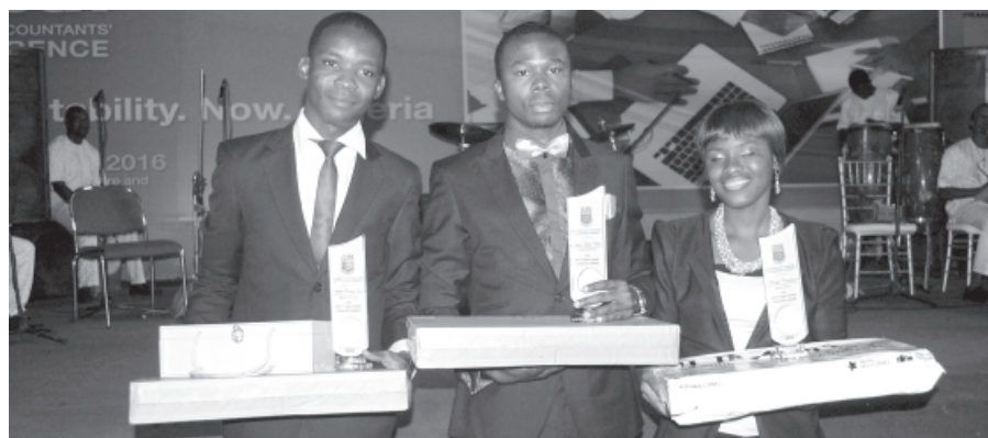
Winners of the essay competition